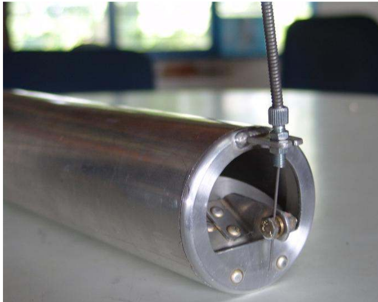
“Open” Air inlet Setting Normally Aspirated

Once welded the manual air inlet to the balance jar of the Turbo system (Airbox) and the cable placed at the air inlet and adapted to the interior of the cabin, it is ready for operation.