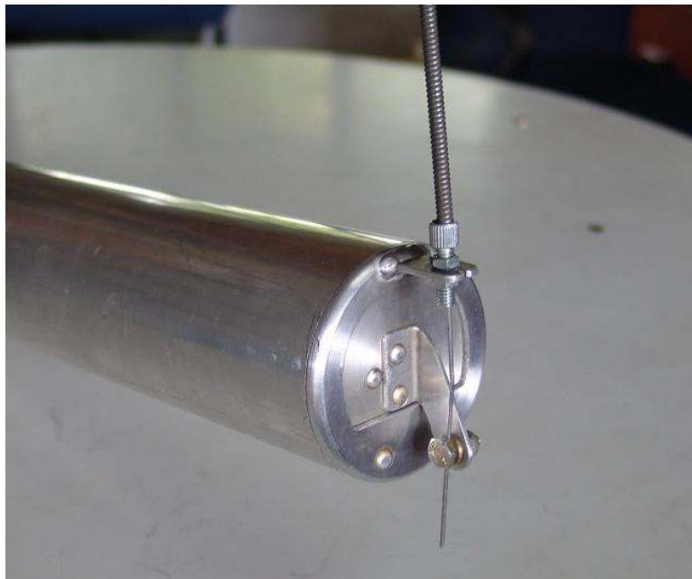
"Closed" air inlet. Setting to operate the Turbo system Turbo

This lid should keep the internal diameter of the Turbo System's balance jar (Airbox) to introduce in it , once this process is done, weld the lid to the balance jar (Airbox) and then adapt a cable in the system to be manually operated from inside of the cabin.